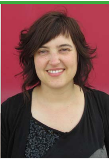
Think Thank Group Coordinators

The Think-Tank group is currently engaged in the creation of a group within the LinkedIn Network designated as 'ECIs-POSITIVe' with the aim of putting all ECI's in contact so that they can get to know each other and start discussions of interest in relation to the main objectives of POSITIVe. LinkedIn allows for the free participation of a larger number of people than asana.com. They will initiate the process by individual presentations of the ECIs and the setting up of discussions on various different topics such as, for example, the formulation of new functional foods or drinks combining polyphenol rich products with deuterium depleted water which appears to enhance the absorption of bioactive compounds in cells. The first on-line meeting is planned to take place the last week of June.