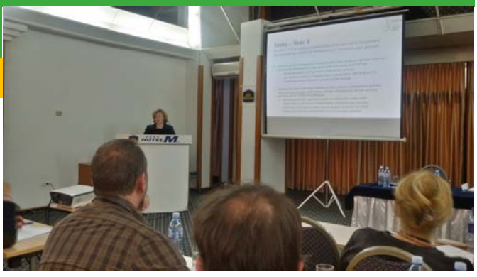
POSITIVe Opening Meeting in Belgrade, Serbia